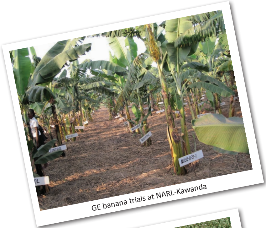
GE banana trials at NARL-Kawanda