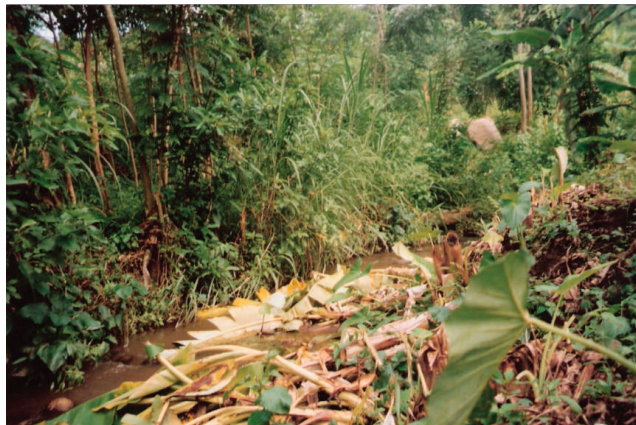
FIGURE 2 Encroachment: banana, yams, and eucalyptus trees planted along the Mpondwe River in Kasese district.

Nyamwamba River in Kasese, the Mugwanjura Gravity Flow Scheme in Ntungamo, and the Rwizi River in Mbarara were found to be experiencing drastic water reduction. This water crisis is further aggravated by environmental degradation in the form of high soil erosion rates, and the reported decrease of the water table leading to nonfunctionality of public water works, as well as a change in local climatic conditions. For example, Mzee Karoli Kanyinondi (72) of Mbarara explained during an interview that the dry season—which used to occur in July–October in Ankole—can no longer be predicted and now occurs at any time. As a result, all districts visited reported seasonal shortages of food due to crop failures and unpredictable rains.