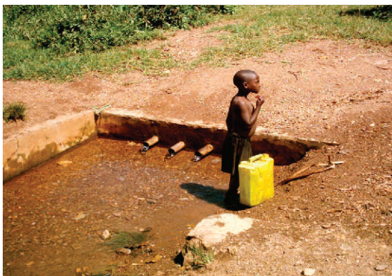
FIGURE 3 Poor maintenance: the immediate surroundings of this protected spring are not maintained. This affects both water quality and yield.